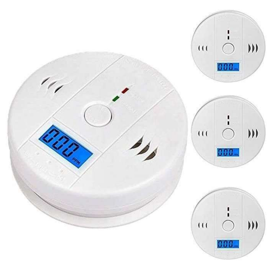
Recalled Zhengzhou Winsen Electronics Technology Co Ltd CO alarm