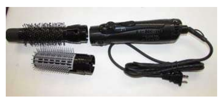
Recalled tiamo airtrack, SUNBA YOUTH STORE/Naisen hair dryer