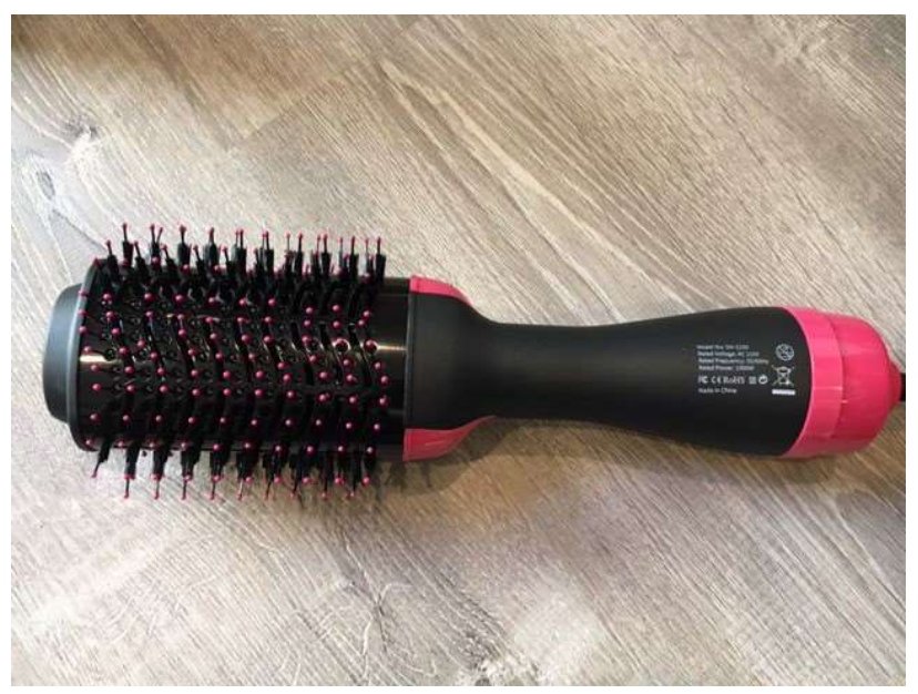
Recalled ADTZYLD and LEMOCA hair dryer