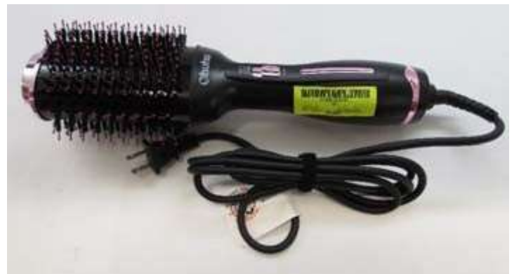
Recalled Ohuhu hair dryer