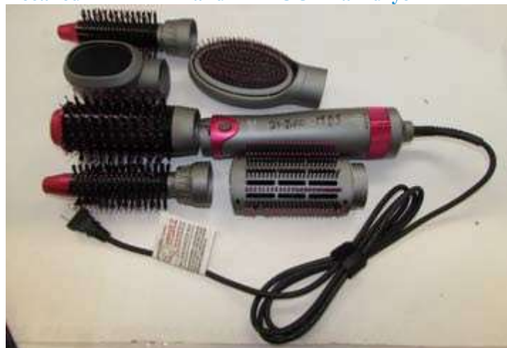
Recalled KENLOR, Romancelink and BZ hair dryer