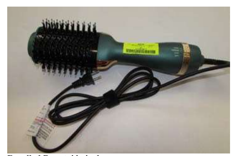
Recalled Bongtai hair dryer