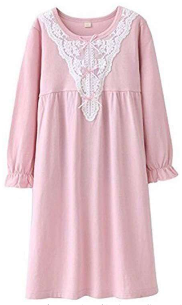
Recalled HOYMN Little Girls' Lace Cotton Nightgown