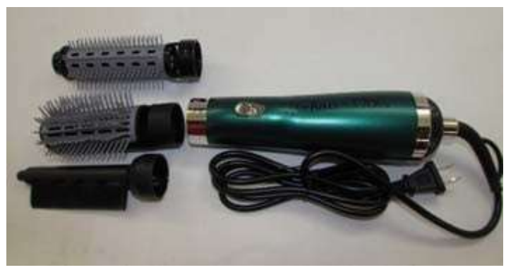
Recalled OWEILAN hair dryer