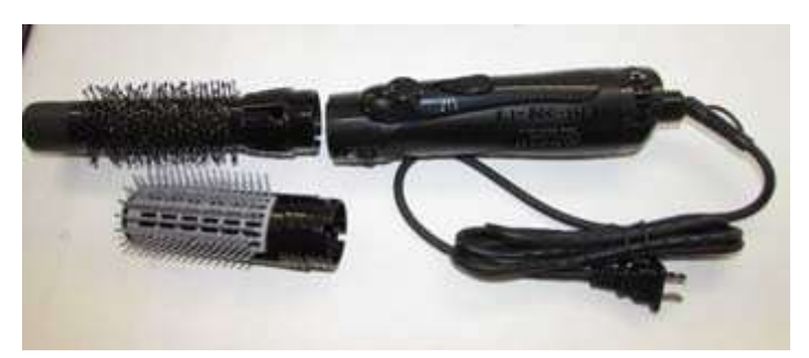
Recalled tiamo airtrack, SUNBA YOUTH STORE/Naisen hair dryer