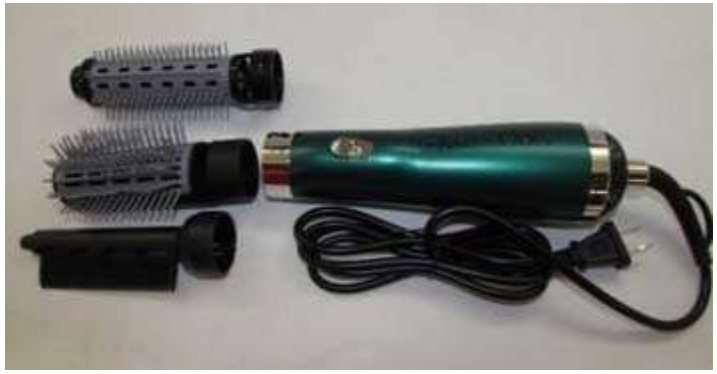
Recalled OWEILAN hair dryer