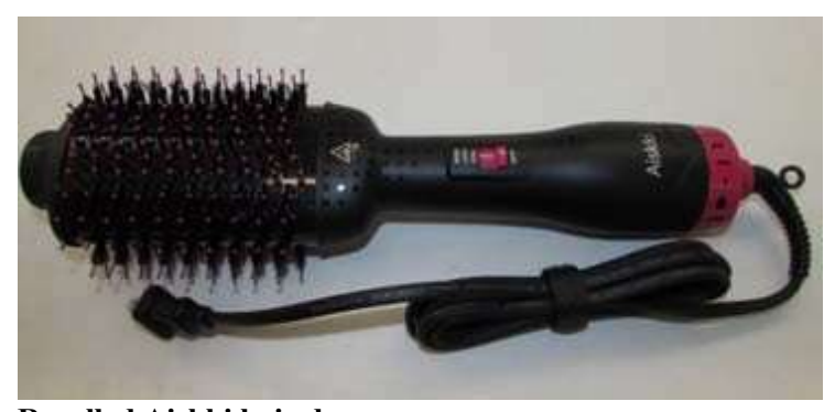
Recalled Aiskki hair dryer