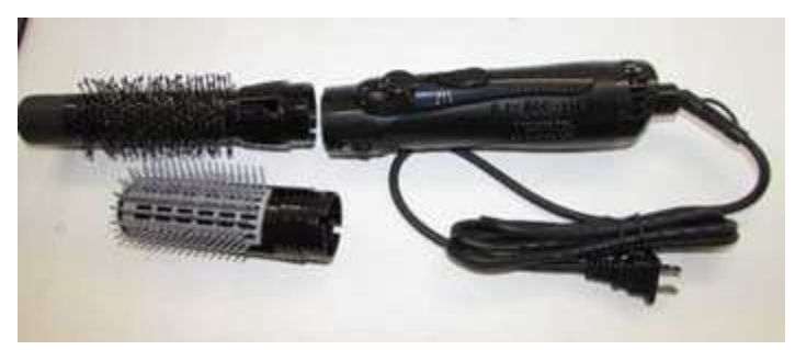
Recalled tiamo airtrack, SUNBA YOUTH STORE/Naisen hair dryer