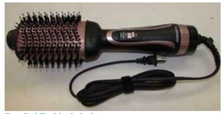
Recalled Techip, hair dryer