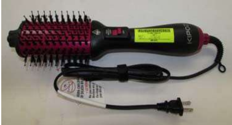
Recalled KIPOZI hair dryer