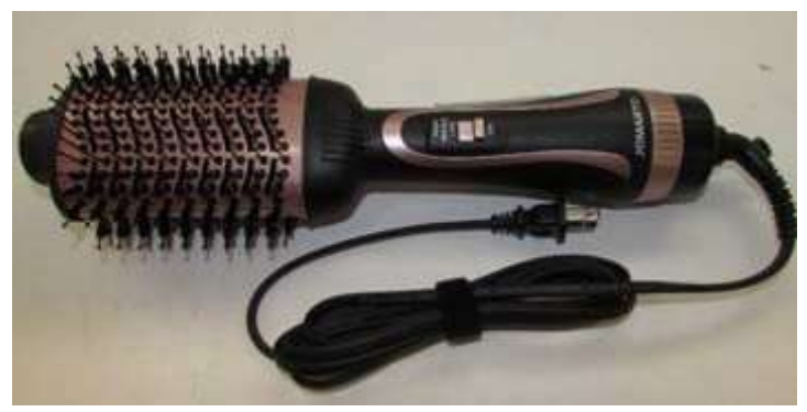
Recalled Techip, hair dryer