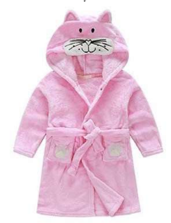
Recalled Taiycyxgan "Little Girl's Coral Fleece Bathrobe