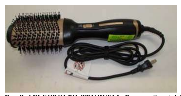
Recalled ELECDOLPH, TDYJWELL, Bownyo, Songtai, Surelang Store Shaboo Prints hair dryer