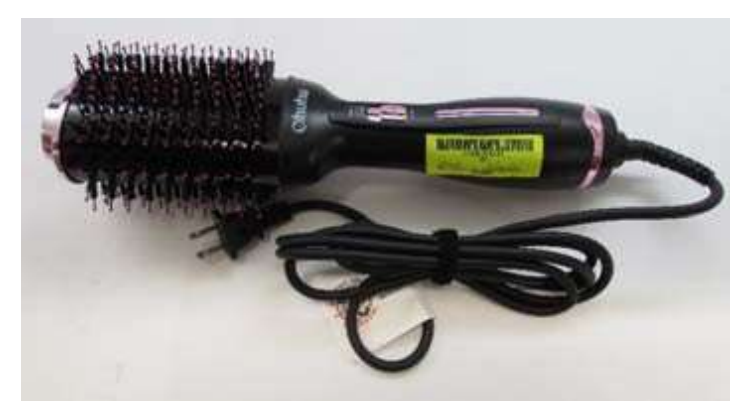
Recalled Ohuhu hair dryer