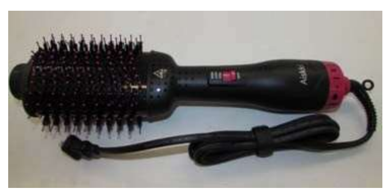
Recalled Aiskki hair dryer