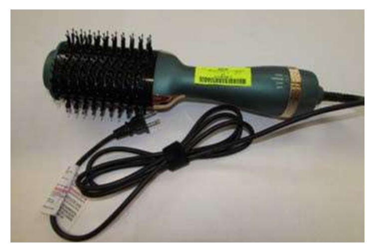
Recalled Bongtai hair dryer