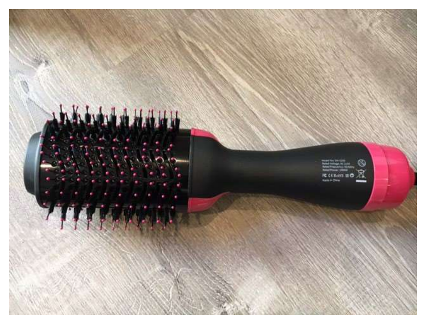
Recalled ADTZYLD and LEMOCA hair dryer