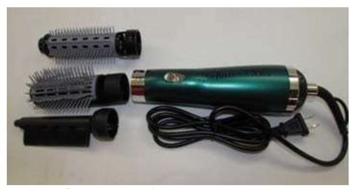
Recalled OWEILAN hair dryer