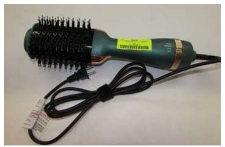
Recalled Bongtai hair dryer