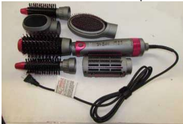
Recalled KENLOR, Romancelink and BZ hair dryer