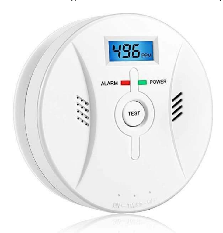
Recalled BQQZHZCO alarm

Individual Commissioners may have statements related to this topic. Please visit <a href="https://www.cpsc.gov/commissioners">www.cpsc.gov/commissioners</a> to search for statements related to this or other topics.