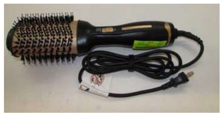
Recalled ELECDOLPH, TDYJWELL, Bownyo, Songtai, Surelang Store Shaboo Prints hair dryer