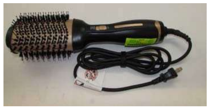
Recalled ELECDOLPH, TDYJWELL, Bownyo, Songtai, Surelang Store Shaboo Prints hair dryer