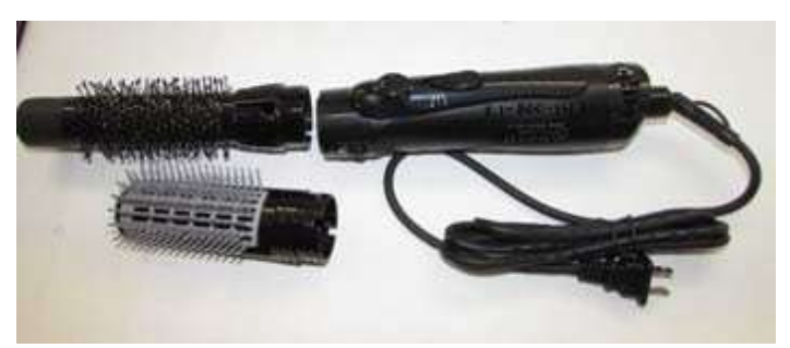
Recalled tiamo airtrack, SUNBA YOUTH STORE/Naisen hair dryer