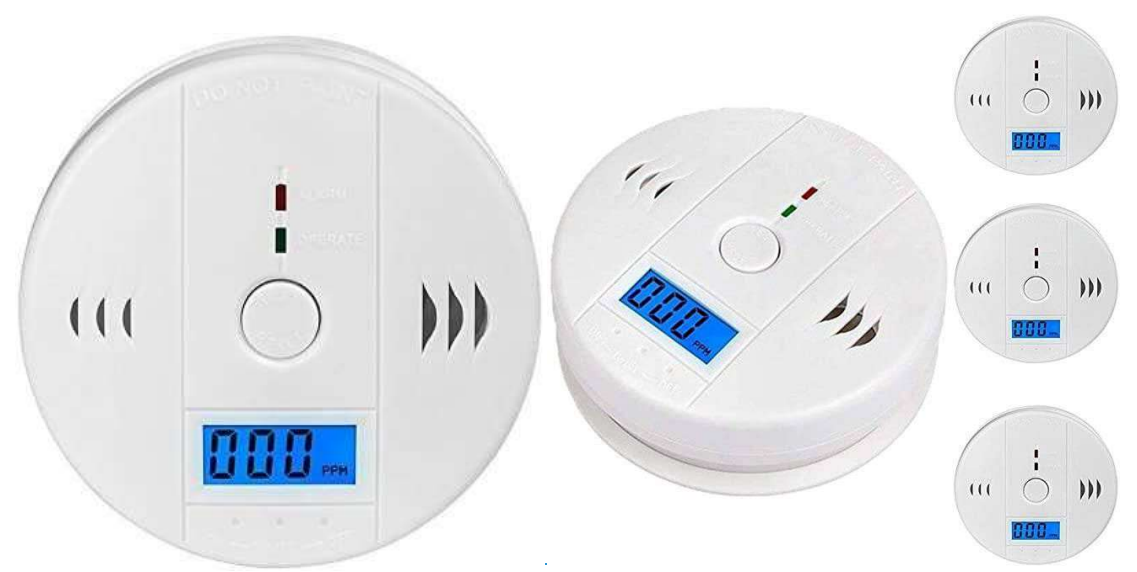
The CO detector manufactured by WJZXTEK and the two detectors manufactured by Zhengzhou Winsen Electronics Technology Company have a carbon monoxide indicator below the test button, and the red and green indicators arranged in a vertical line above the test button. None of the CO detectors have a visible logo or brand name.

Please immediately cease selling the recalled CO detectors. If you have recalled CO detectors in your inventory, please either destroy them immediately or send them to us for destruction. If you choose to destroy your inventory, please provide us with a certificate of destruction which contains how many units you destroyed, the method of destruction, and the location of that destruction.