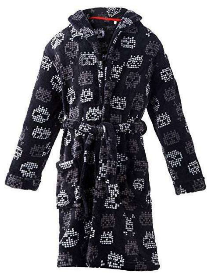
Recalled home swee Boys Plush Fleece Robe Shawl