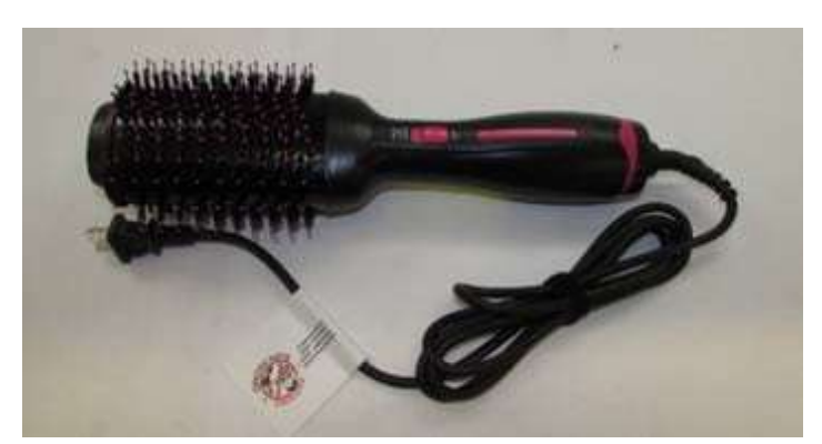
Recalled OSEIDOO, SARCCH, Raxurt Store, Xianming, VIBOOS, Lets Funny, Byser Store, GEPORAY, Miserwe, BEAUTIKEN, Admitrack, LANIC, Dekugaa Store and ADTZYLD hair dryer

The hairdryers were sold in multiple colors and styles and/or with interchangeable brush heads. When turned on, air enters the hairdryers at the base of the handle, a heating element warms the air, and the air exits through openings along the length of the hairbrush. The products are designed to straighten, curl and wave hair. The hairdryers can be identified based on their seller/manufacturer on Amazon.com, which is available below.