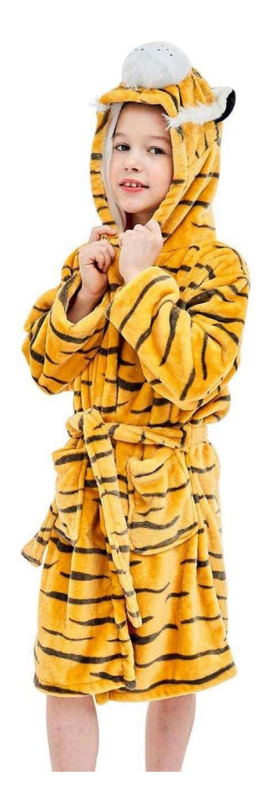
Recalled IDGIRLS Kids Animal Hooded Soft Plush Flannel Bathrobes