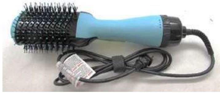
Recalled Nisahok hair dryer

Individual Commissioners may have statements related to this topic. Please visit <a href="https://www.cpsc.gov/commissioners">www.cpsc.gov/commissioners</a> to search for statements related to this or other topics.