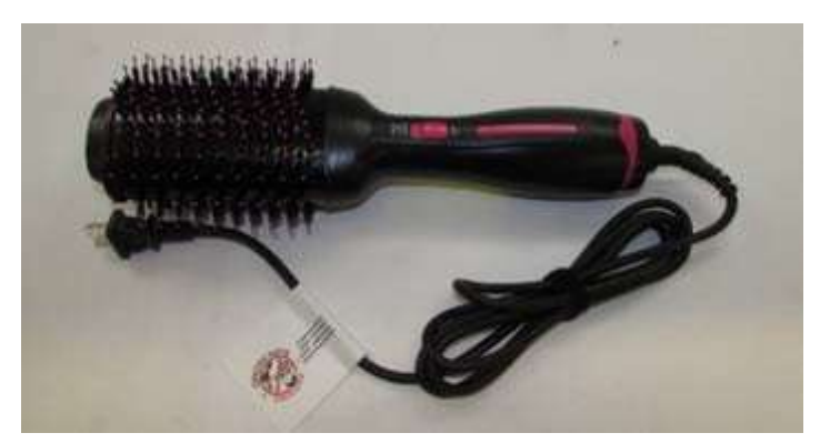
Recalled OSEIDOO, SARCCH, Raxurt Store, Xianming, VIBOOS, Lets Funny, Byser Store, GEPORAY, Miserwe, BEAUTIKEN, Admitrack, LANIC, Dekugaa Store and ADTZYLD hair dryer

The hairdryers were sold in multiple colors and styles and/or with interchangeable brush heads. When turned on, air enters the hairdryers at the base of the handle, a heating element warms the air, and the air exits through openings along the length of the hairbrush. The products are designed to straighten, curl and wave hair. The hairdryers can be identified based on their seller/manufacturer on Amazon.com, which is also visible on your Amazon purchase confirmation. A list of the sellers and manufacturers implicated in the recall is available below.