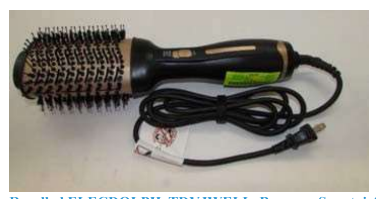
Recalled ELECDOLPH, TDYJWELL, Bownyo, Songtai, Surelang Store Shaboo Prints hair dryer