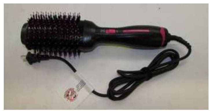
Recalled OSEIDOO, SARCCH, Raxurt Store, Xianming, VIBOOS, Lets Funny, Byser Store, GEPORAY, Miserwe, BEAUTIKEN, Admitrack, LANIC, Dekugaa Store and ADTZYLD hair dryer