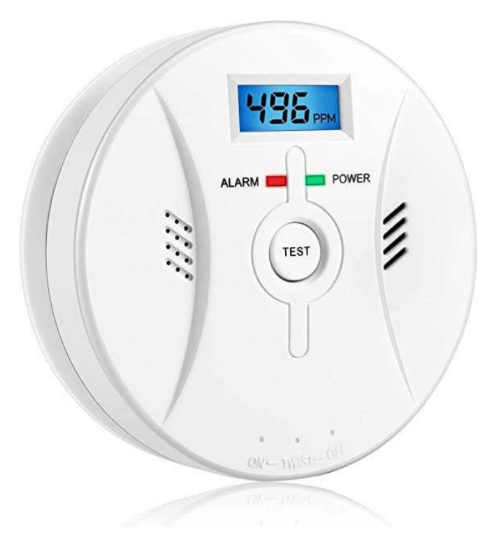
The CO detector manufactured by BQQZHZ features a red "alarm" indicator and a green "power" indicator side-by-side between the test button and a carbon monoxide indicator screen.

The recalled CO detectors all have a round "Test" button in the middle of the unit, with three or four slashes for the speakers on the right and left of the test button.