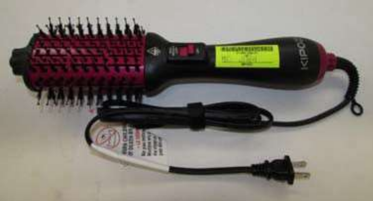
Recalled KIPOZI hair dryer