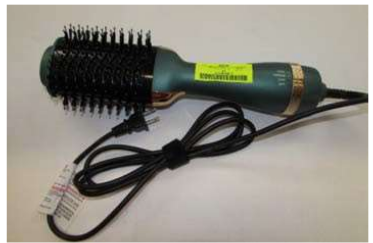
Recalled Bongtai hair dryer