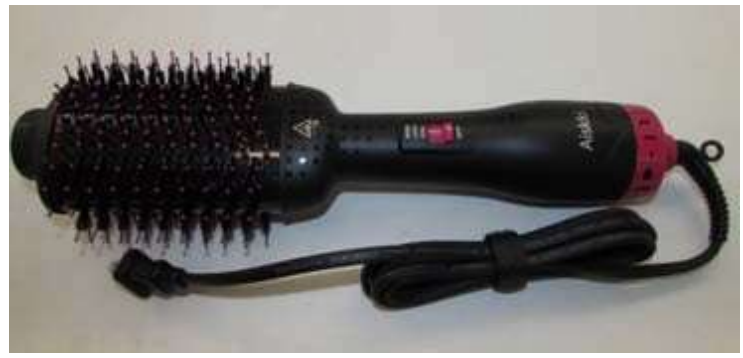
Recalled Aiskki hair dryer

Recalled OSEIDOO, SARCCH, Raxurt Store, Xianming, VIBOOS, Lets Funny, Byser Store, GEPORAY, Miserwe, BEAUTIKEN, Admitrack, LANIC, Dekugaa Store and ADTZYLD hair dryer