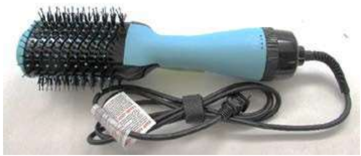
Recalled Nisahok hair dryer

<u>Please If you still have a recalled hairdryer in your household, please immediately stop using the recalled hairdryersit.</u> You may have previously received a communication from Amazon regarding this product. To receive a full refund, you can [Insert Amazon's choice of product destruction verification] either destroy the hairdryer by cutting the cord and submit a photo of the destroyed product, or request a pre-paid mailing label and return the product to us.