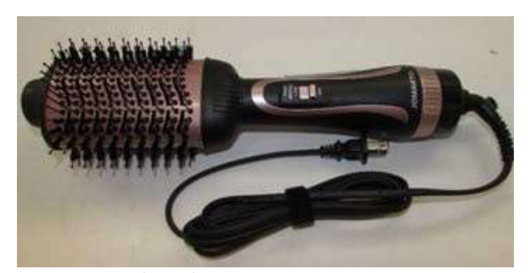
Recalled Techip, hair dryer