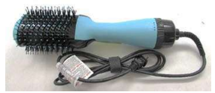
Recalled Nisahok hair dryer

Please immediately cease distributing the recalled <u>hair dryers</u>. If you have recalled <del>CO</del> detectors <u>hair dryers</u> in your inventory, please <u>either</u> destroy them immediately <u>or send them to</u> <u>us for destruction</u>. If you choose to destroy your inventory, please <u>and</u> provide <u>us the CPSC</u> with a certificate of destruction which contains how many units you destroyed, the method of destruction, and the location of that destruction.