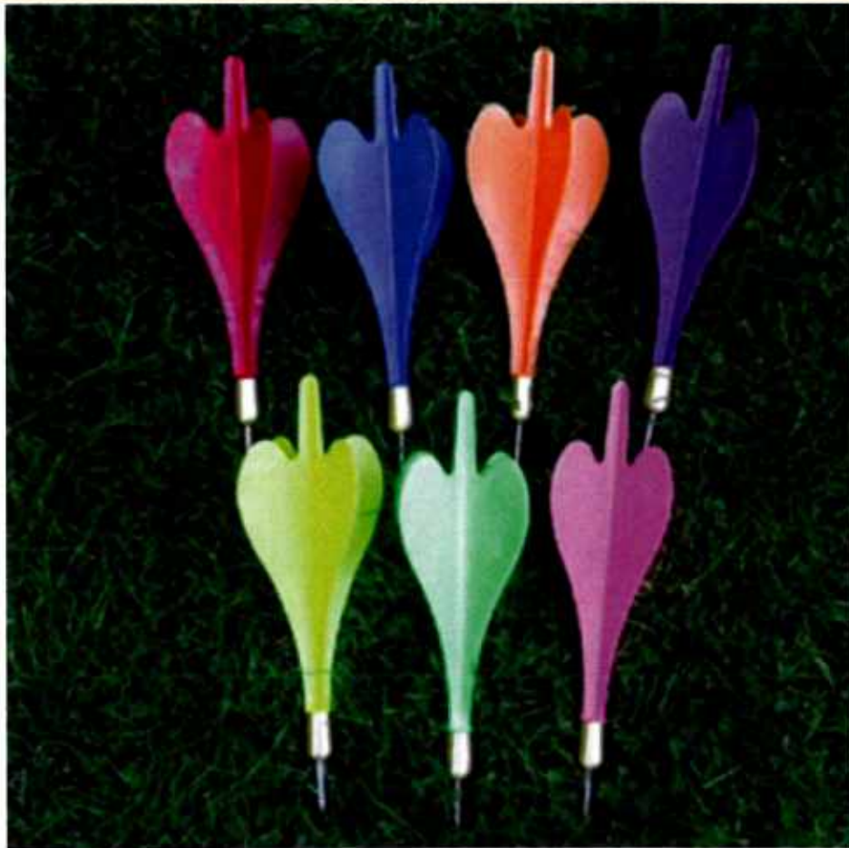
Recalled Crown UK lawn darts