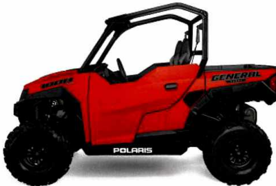
2016 POLARIS GENERAL 1000 EPS INDY RED