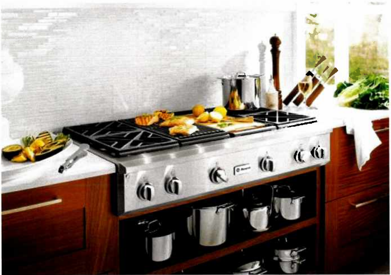
Recalled gas range top

Note: Health Canada's press release is available here .