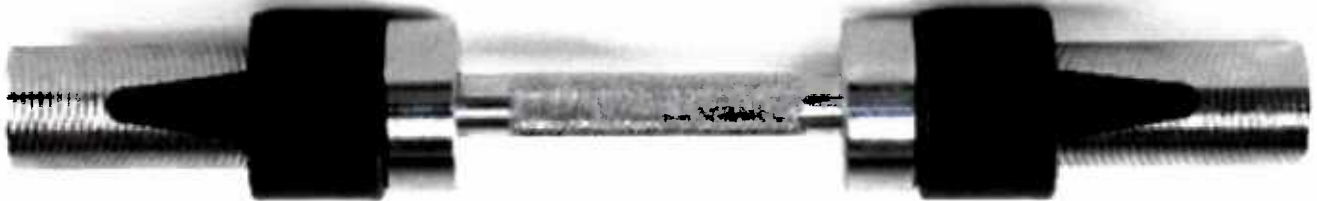
Recalled OBB-20 Fitness Gear Olympic Dumbbell Handle with locking collars in black