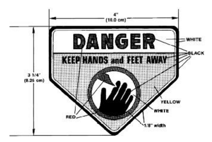
Figure 2 Warning Label

blade housing of a rotary mower as close as possible to the discharge opening. If the mower does not have a discharge opening, place the label where it will be easily seen while the operator is cutting grass. The label on a reel-type mower must be on the mower deck as close as possible to the center of the cutting width.