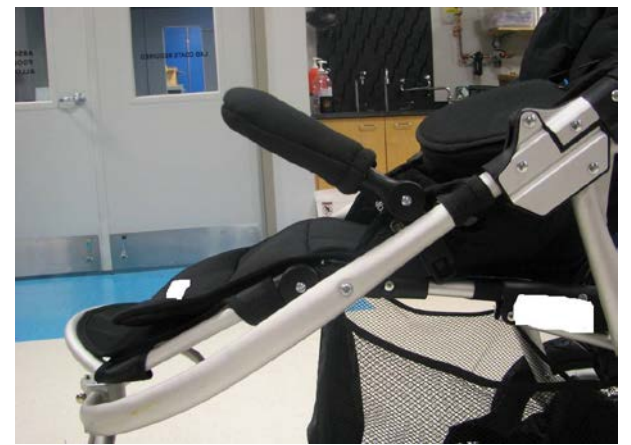
Figure 2. Grab bar in the car seat attachment position. The opening between the grab bar and seat FAILS ASTM F833-13b, Section 7.12, Passive Containment/Foot Opening Test Method.

Four stroller-related fatalities were reported to CPSC from January 1, 2008 through June 30, 2013. One incident involved a 5-month-old infant whose head became entrapped between the seat and tray. Staff considers the opening between the seat and the tray or the seat and grab bar to be a potentially fatal head entrapment hazard if it fails ASTM F833-13b, Section 7.12, Passive Containment/Foot Opening Test Method .