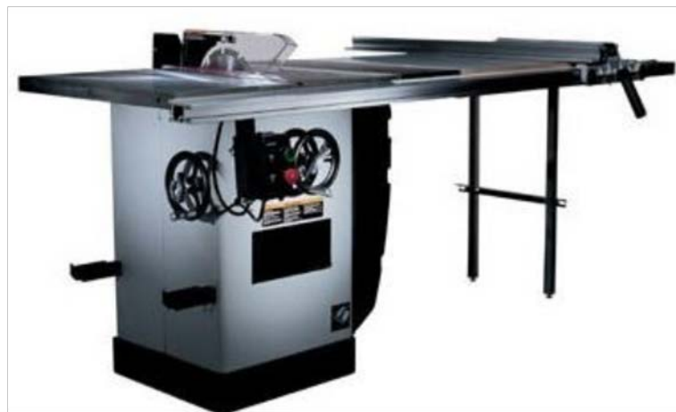
Figure 3. Typical Cabinet Saw

Sliding saws are similar to the cabinet saws in that they are belt driven, but typically are equipped with an extension that allows for cutting of large panels. This type of saw can be wired for either single phase or three phase operation; however, three phase wiring is a more common feature for sliding table saws. Sliding saws operate in the 220-440 volt range. A primary difference between the two types of saws is that sliding table saws have a greater rip capacity for processing plywood.