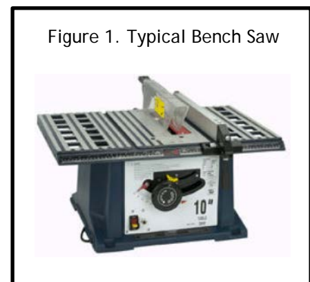
Figure 1. Typical Bench Saw

Bench saws (e.g., benchtop and portable saws; see Figure 1) tend to be lightweight and portable, weighing as little as 34 pounds. Two bench saw models incorporating AIM technology are heavier: SawStops’s JSS-MCA weighs 79 pounds (108 pounds with stand) and the Bosch GTS1041A-09 weighs 78 pounds (133 pounds with stand). 4 Bench saws are popular with professional carpenters due to the ease of transporting them to job sites where they can be placed on a work bench or stand. Most of the bench saw models (25 out of 34) come with some form of stand, either a rolling, folding, or fixed stand. For models including a stand, the stand is included in the retail price. Bench saws generally require only 110- 120 volts and thus can run on ordinary household electric wiring (most home outlets are wired for