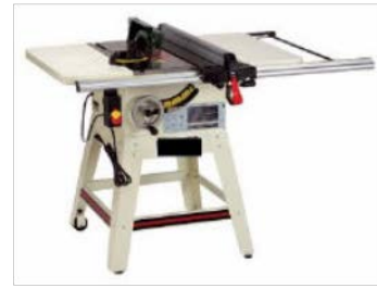
Figure 2. Typical Contractor Saw

Cabinet saws (also called “stationary saws”, see Figure 3) are larger, heavier, and more powerful than contractor saws, and their blades are enclosed in a cabinet. Cabinet saws weigh from 321 to 1,040 pounds. Cabinet saws generally require 230-240-volt power, and some require three-phase wiring, which may make it difficult for these saws to run on typical household current. Power ratings are usually in the two to five horsepower range, but can sometimes exceed this range. Some cabinet saws can accommodate larger blade sizes than the 10-inch blade size available with bench and contractor saws. The blade is driven with one or more belts.