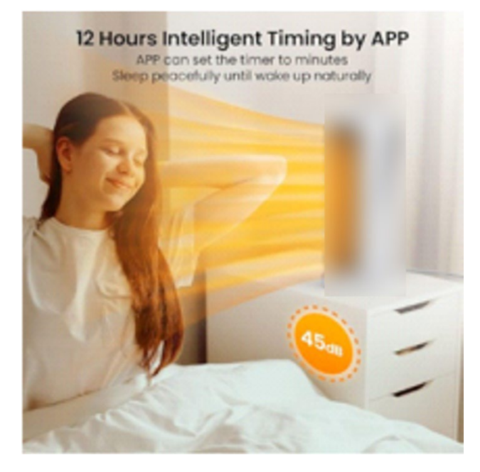
Figure 3. Non-certified portable electric heater marketing image showing hazardous use close to curtains and during sleep.

In addition, current products on an online marketplace and retailer websites have shown concerning marketing images that demonstrate unsafe use scenarios. Every product observed has shown marketing images with portable electric heaters being close to flammable products (fabrics, clothes) and/or has shown the product unattended as seen in Figures 3-5.