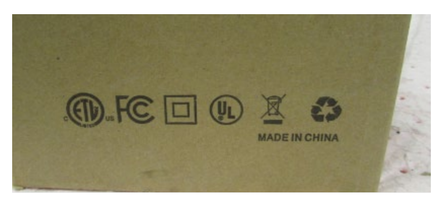
Figure 7. Space portable heater with UL and ETL certifications on packaging.<sup>6</sup>