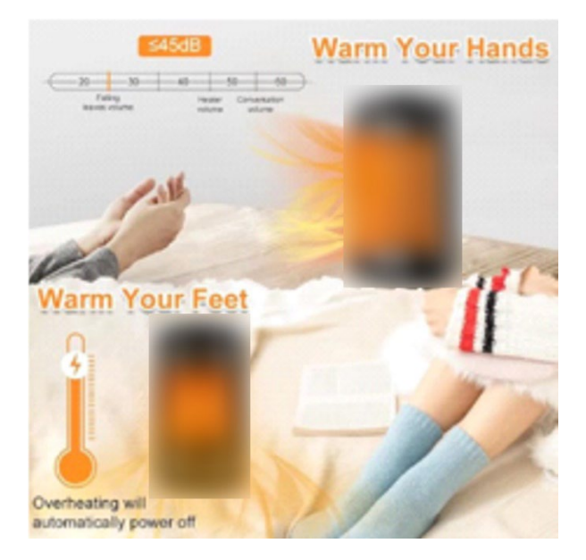
Figure 4. Portable electric heater with possible counterfeit certification markings with marketing image showing hazardous use close to fabrics.