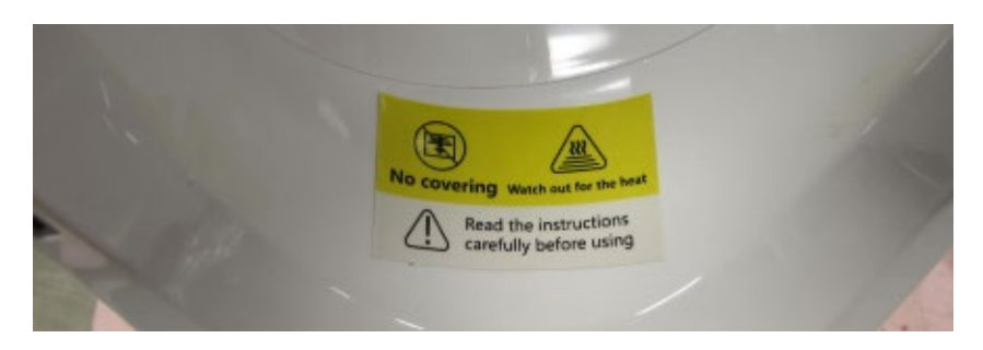
Figure 8. Non-compliant with UL 1278, section 67.14 warning label.

For the heater in Figure 8, staff determined that the heater did not follow the following requirements: