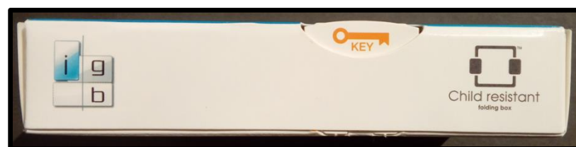
Figure 2 Key Stored in Side of Box

The box is opened by removing the key from its storage slot in the long side of the box (Figures 2, 3), inserting the key into key lock openings in the short side of the box (Figure 4, 5), and then opening the folded and tucked short end by pulling and rotating out at the fold (Figure 6).