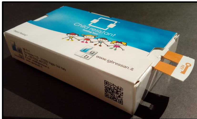
Figure 5 Key Entering Lock