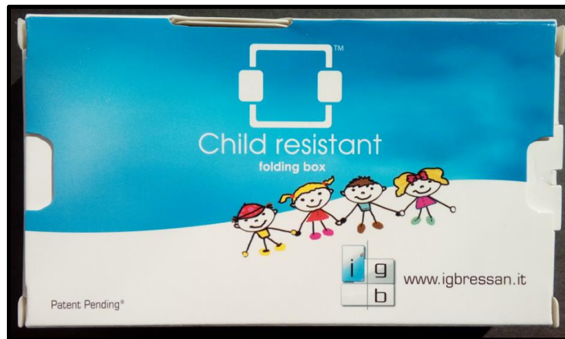
Figure 1 Top View

This package consists of two pieces, both laminated fiberboard: a folded rectilinear box with folded ends and tucked flaps (Figure 1), and a separable key, stored in the box side (Figure 2).