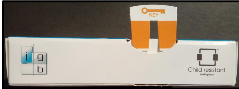
Figure 3 Key Removed from Storage