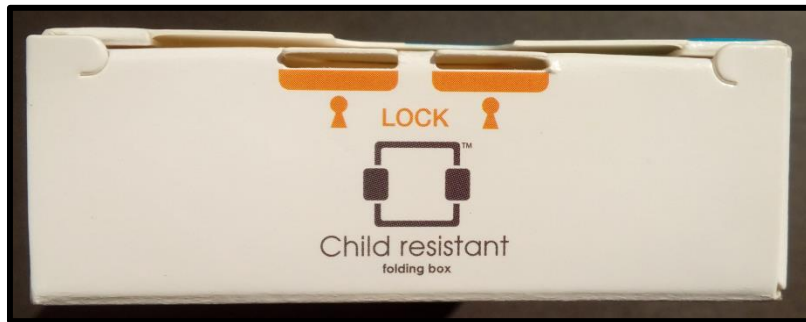
Figure 4 Lock in Side of Box