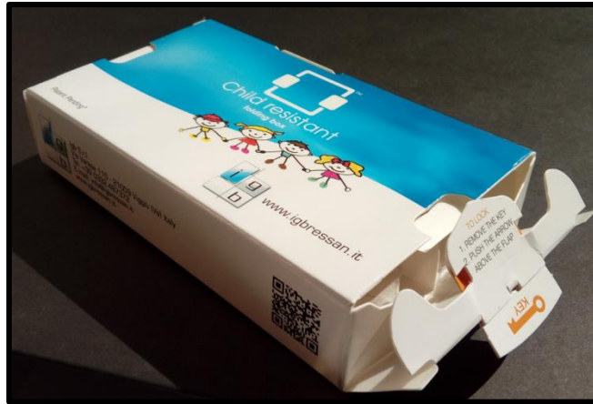
Figure 6 Unlocked and Opened Box

The manufacturer's instructions to open and close the box are shown in Figure 7: