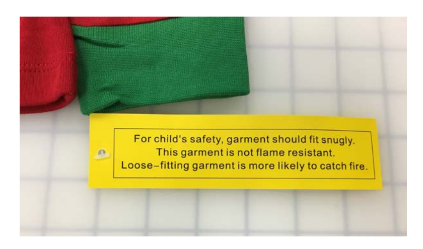
Figure 2: Tight-fitting sleepwear must bear a specific hangtag bearing no other information or have a label on the packaging