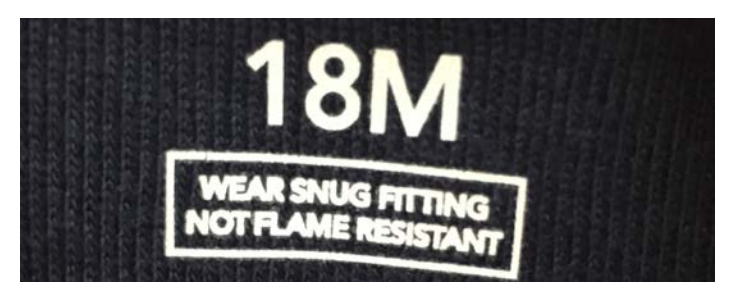
Figure 1 - Tight-fitting sleepwear must also bear a label immediately below the size designation on the front of the sizing label located on the center back of the garment

Tight fitting sleepwear must comply with all of the flammability requirements for clothing textiles (16 CFR 1610) or vinyl plastic film (if applicable).