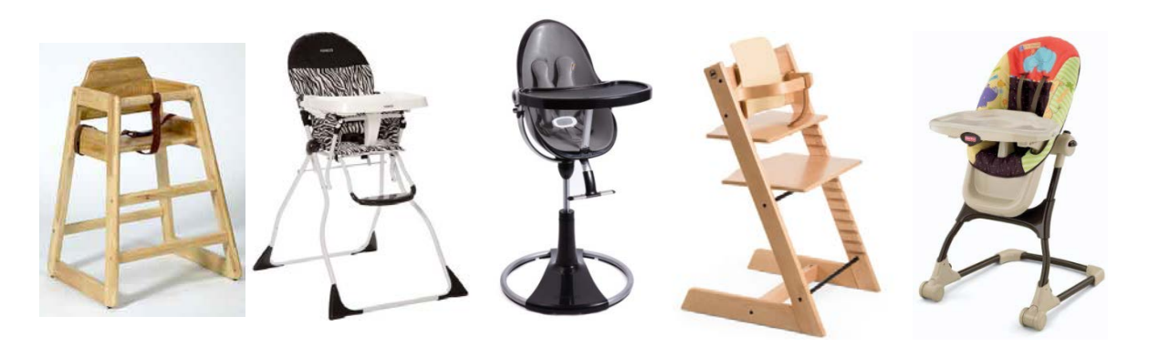
Figure 1: High Chair Examples

frame" styles, single "leg" pedestals, as well as "Z" frames (shown in respective order in Figure 1).