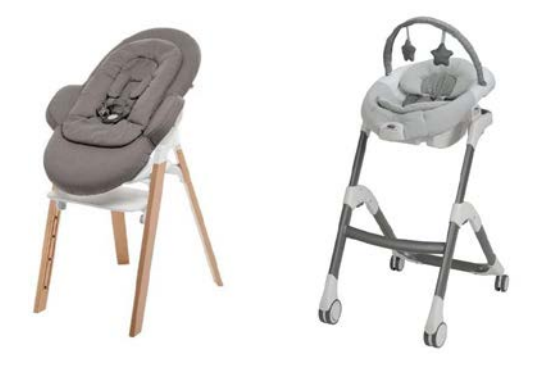
Figure 2: Reclining Seat High Chair Examples

2. Youth chairs with an installed restraint system accessory that converts the chair into a high chair for use with children younger than 3 years of age, for feeding or eating, would likely come under the scope of the high chair standard. If that same youth chair also offers a reclined infant seat accessory, the chair would also come under the scope of the high chair standard with the reclined infant seat accessory installed.