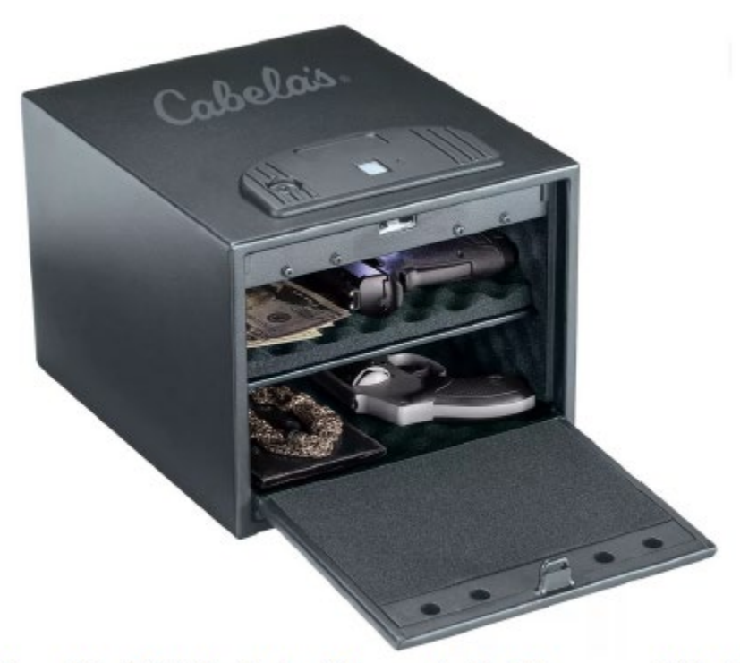
Recalled Cabela's Biometric Personal Safe, 55B30BP