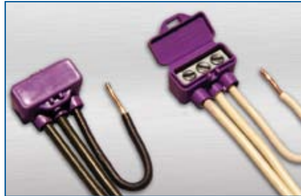
The AlumiConn Connector

CPSC staff recognizes that copper replacement may be cost prohibitive and that the COPALUM repair may be unavailable in a locality. Based upon an evaluation that was, in part, CPSC supported, 5 consumers are advised that, if the COPALUM repair is not available, the AlumiConn connector may be considered the next best alternative for a permanent repair. This repair method involves pigtailing using a setscrew type connector instead of the COPALUM crimp connector in the repaired connections. The AlumiConn connector has performed well in initial tests, but is too new to have developed a significant long-term safe performance history as the COPALUM repair. The repair should be conducted by a qualified electrician because careful, professional workmanship and thoroughness are required to make the AlumiConn connector repair safe and permanent.