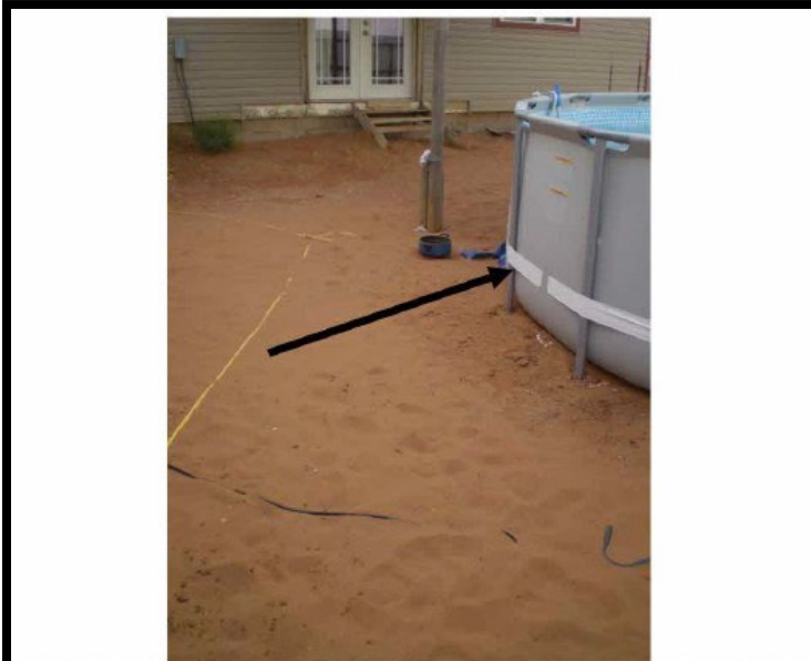
SHERIFF'S PHOTO #3: This photo shows the side of the pool. The mother's theory is that her daughter was able to get her footing on these white straps and grab one of the gray poles and essentially "walk" up the side of the pool. The mother said that they found footprints on the side afterwards (did not have pictures); however, the sheriff's office did not note or see these.

Ladder kept at side of house when not in use (mother placed it there the morning of the incident) Pool pump was held on a flat-bed wagon on the side of the pool (Sheriff's office theorized this could have been used to gain access)