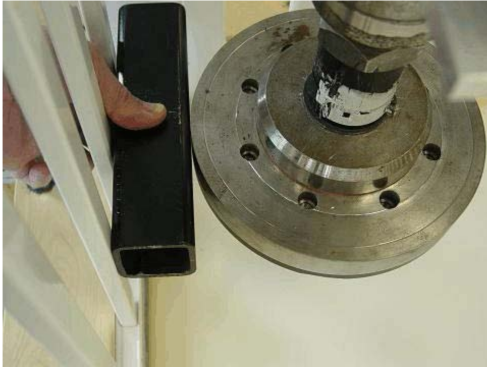
Figure D. Impact Mass and Spacer Block.