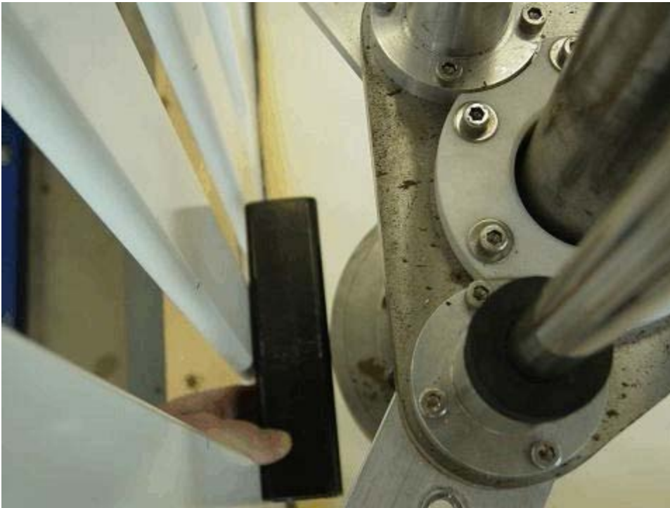
Figure C. Spacer Block (top view).

center of the impact mass 6 in. (150 mm) from the two sides forming the corners of the crib. To position the mass for a standard rectangular shaped crib place a 2 in. (50 mm) spacer block against one of the sides of the corner to be tested and move the impact mass until it touches the spacer block (see Figure C). Repeat this process for the other side that makes up the corner to be tested (see Figure D).