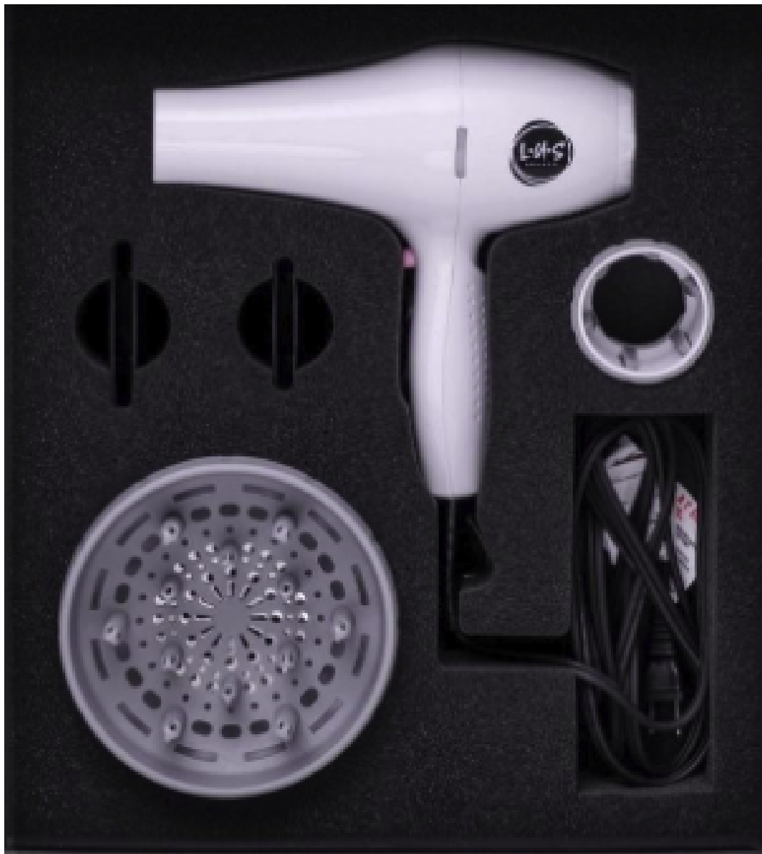
Recalled LUS Hair Dryer & Diffuser in Box